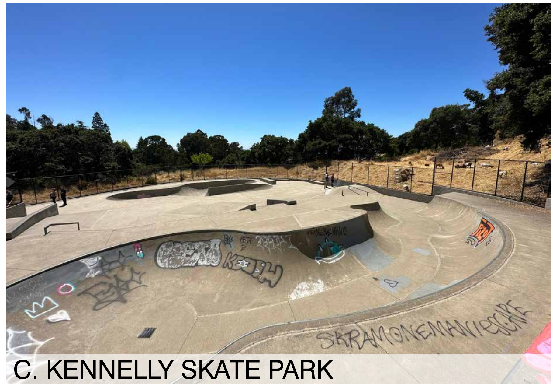
C. KENNELLY SKATE PARK