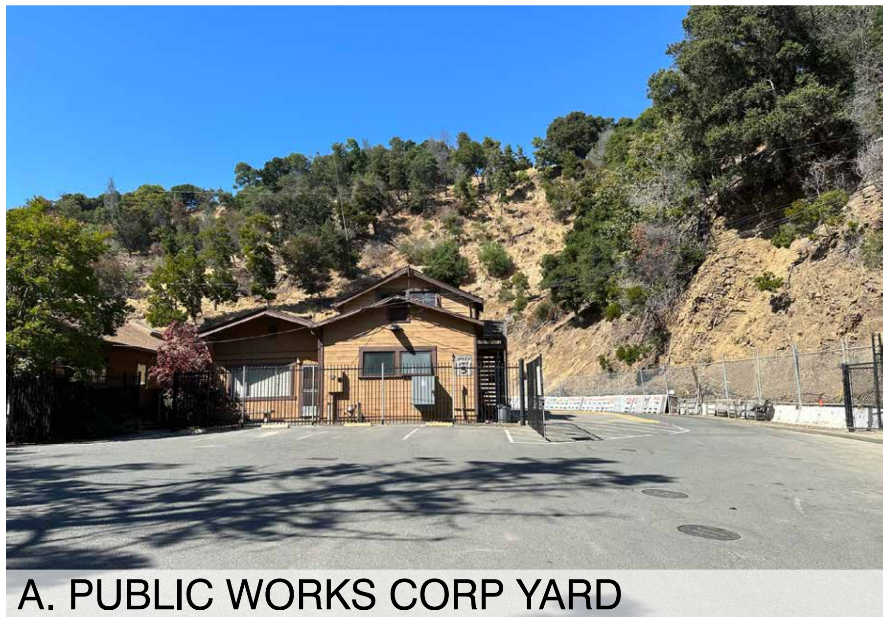
A. PUBLIC WORKS CORP YARD