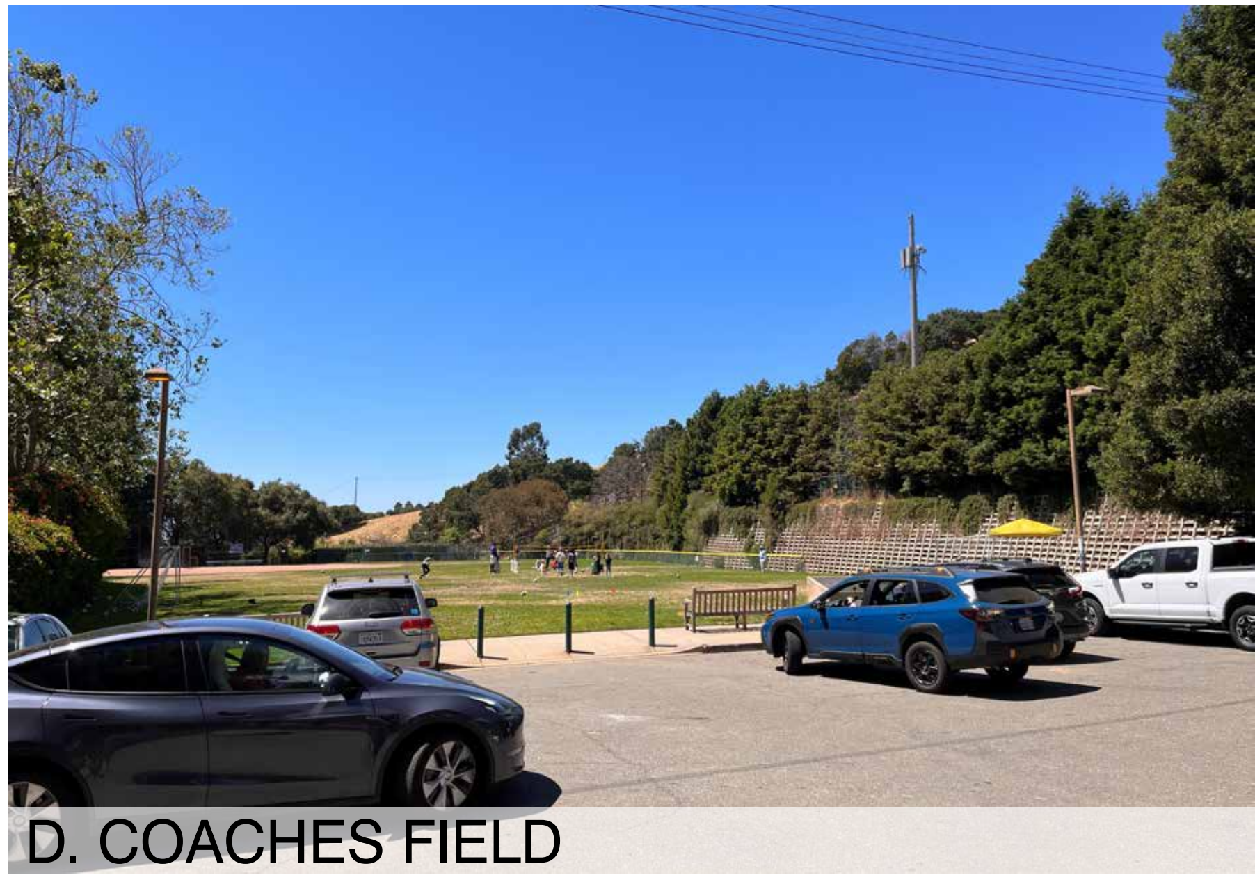
D. COACHES FIELD