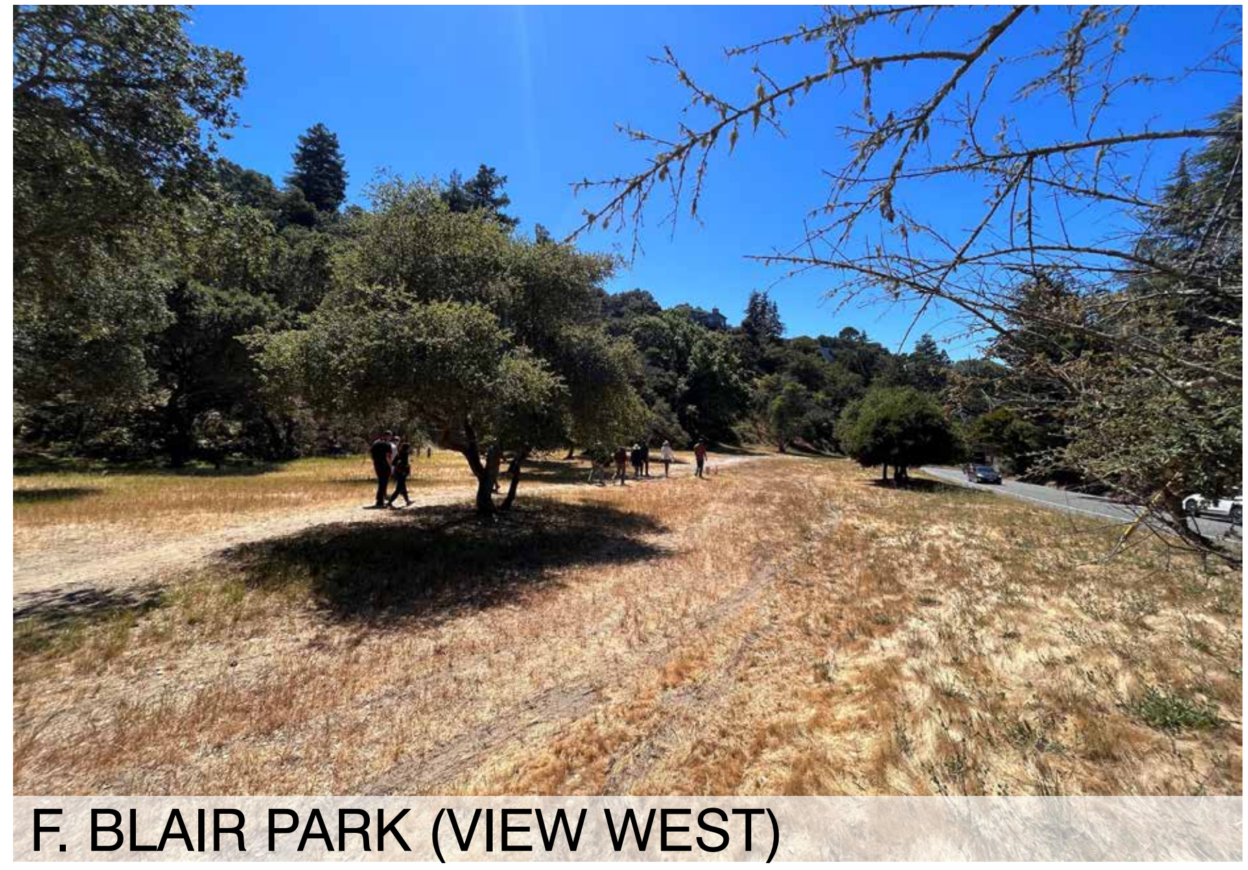
F. BLAIR PARK (VIEW WEST)