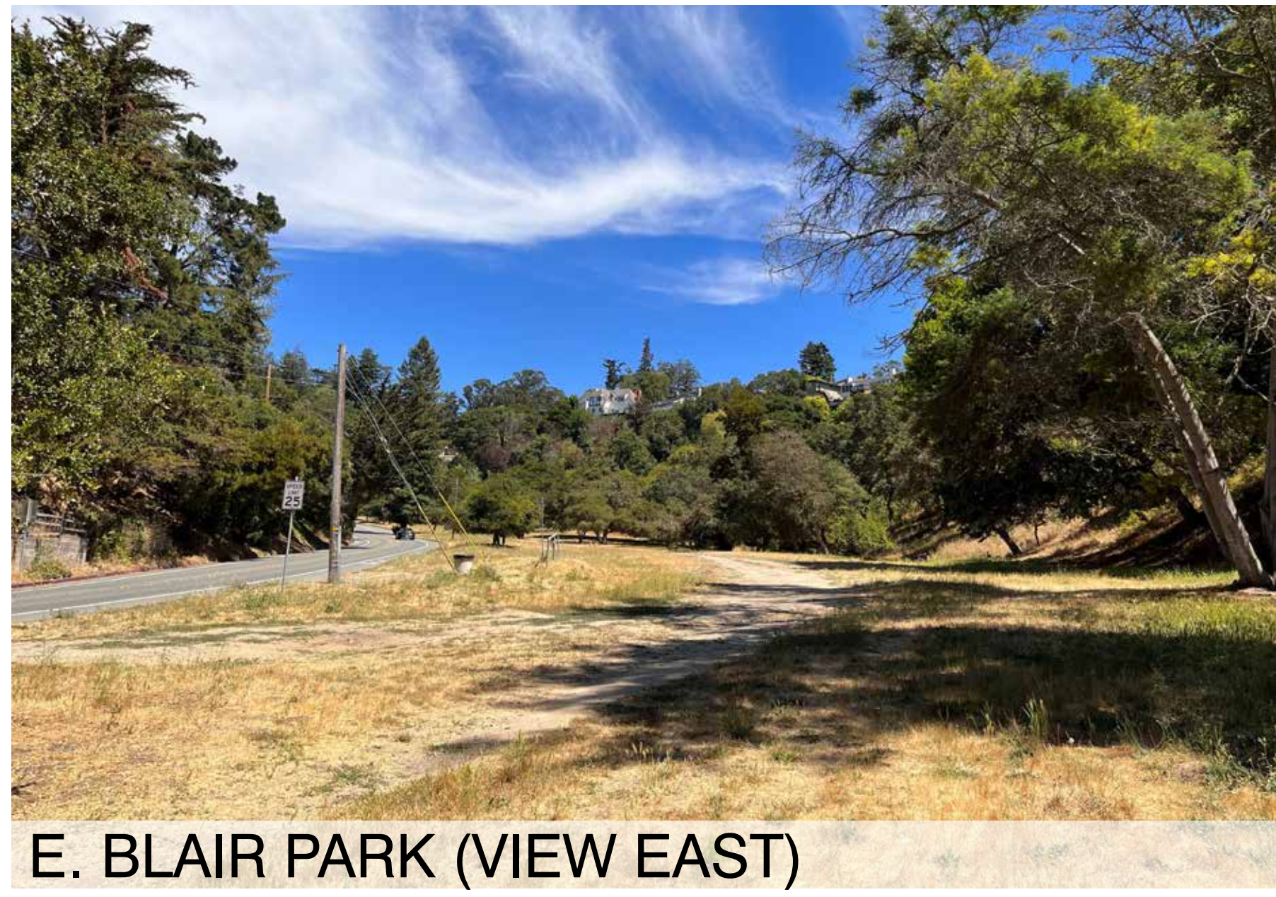
E. BLAIR PARK (VIEW EAST)